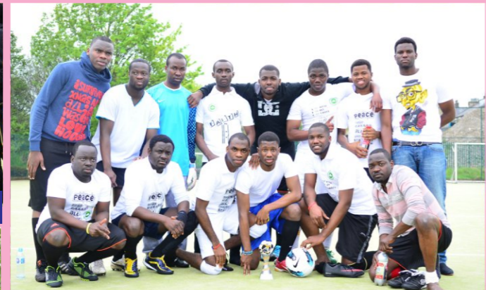
Chapel of His Glory FC