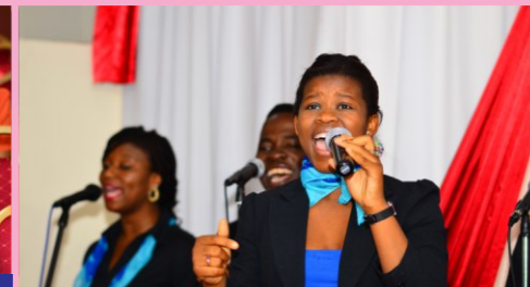
Chapel of His Glory Choirs