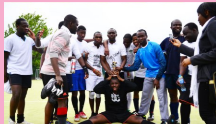
Chapel of His Glory FC wins the Pastors Cup