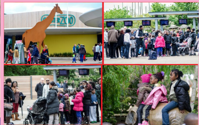
COG Children/Members @ Chester Zoo