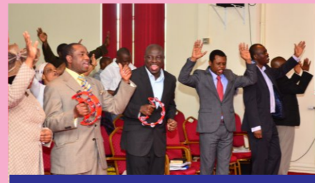
COG Ministers and Members in Praise & Worship