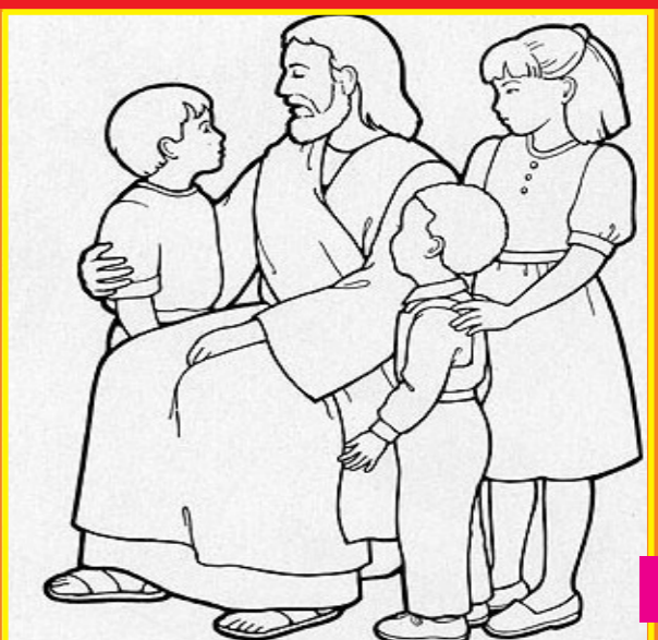
Children with Christ